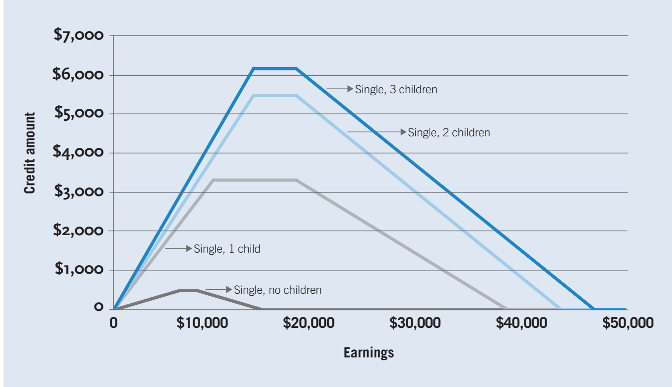
FIGURE 2: EITC BY NUMBER OF CHILDREN AND FILING STATUS, 2014